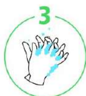
In between the fingers